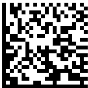
Erase Prefix & Suffix Data

4. Finally, before you begin scanning any RapId© Tags, scan the attached two codes with your RapID scanner in order --- This will ensure that after every scan the scanner will simulate a "tab" which will allow you to continuously scan mice when enrolling them into SoftMouse without needing to use your mouse / keyboard to go to the next mouse after scan.