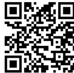
Erase Prefix & Suffix Data